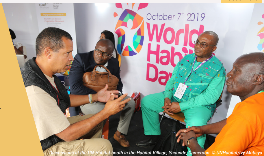
Discussions at the UN-Habitat booth in the Habitat Village, Yaounde, Cameroon.

The Newsletter aims to provide you with all the information you need to know about Urban October 2020 and how to participate.