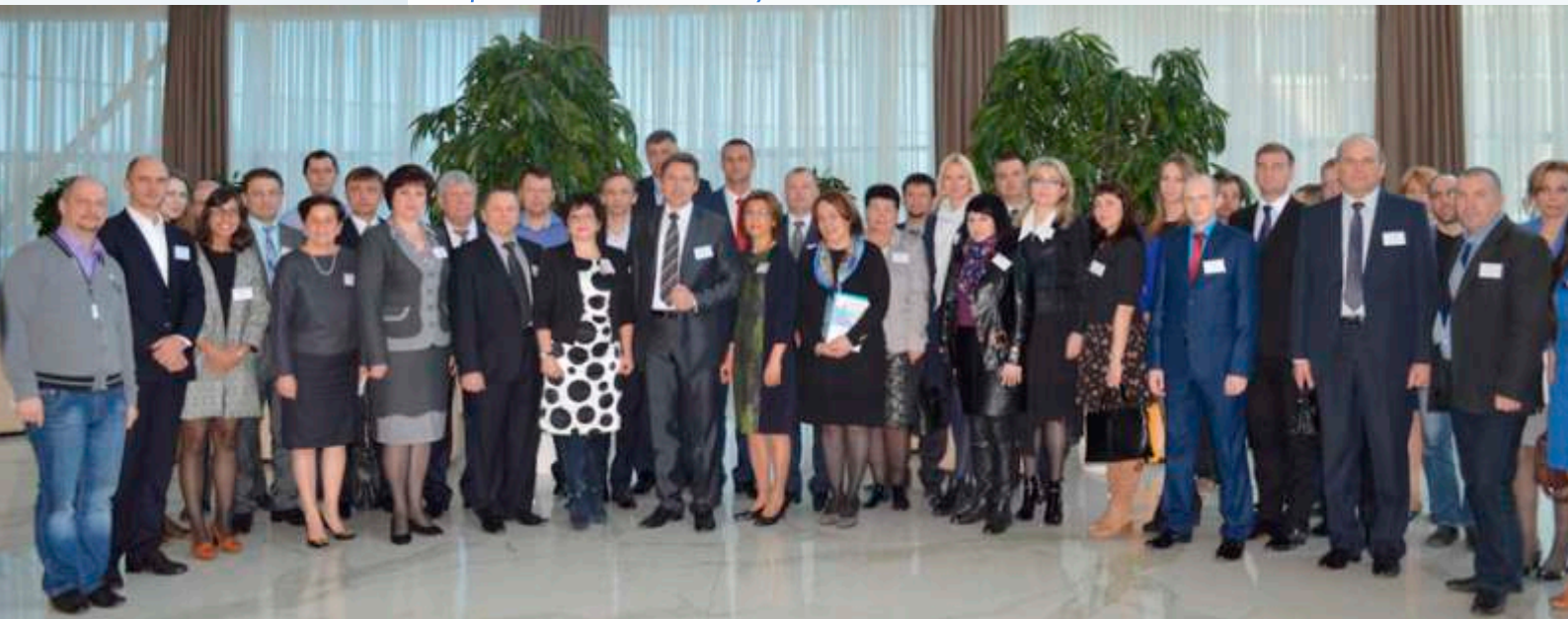
Cooperation with the Republic of Belarus