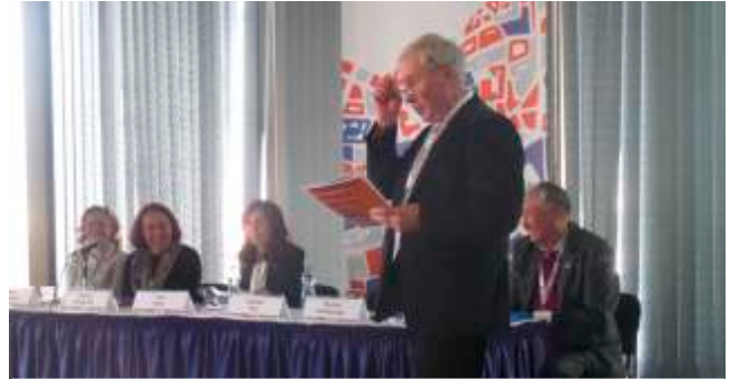
CIS regional report

03/2016 High-level delegations from St.Petersburg and Yakutsk attend the Barcelona Resilience Week