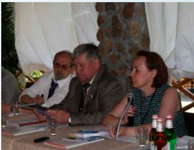
Side event at CIS mayors' meeting in Vladikavkaz)

06/2014 A side event on the upcoming Habitat III Conference held at a meeting of CIS mayors in Vladikavkaz (Russia)