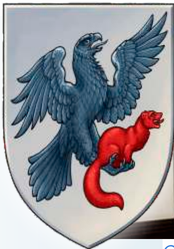
Cooperation with the City of Yakutsk