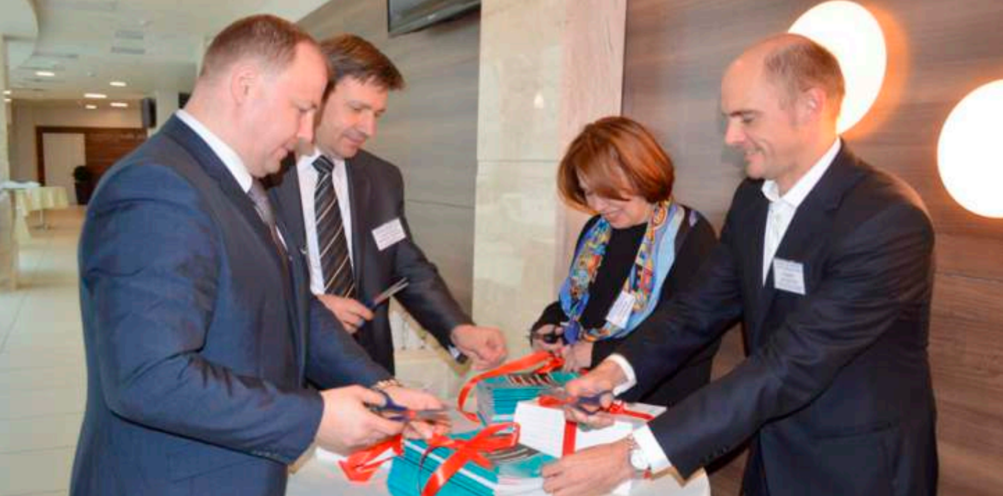
Launch of UN-Habitat publications in Minsk (Republic of Belarus)

04/2016 The Russian version of Urban Planning for City Leaders and International Guidelines on Urban and Territorial Planning launched in Minsk. Training seminar for chief architects and vice mayors of Belarus cities was held