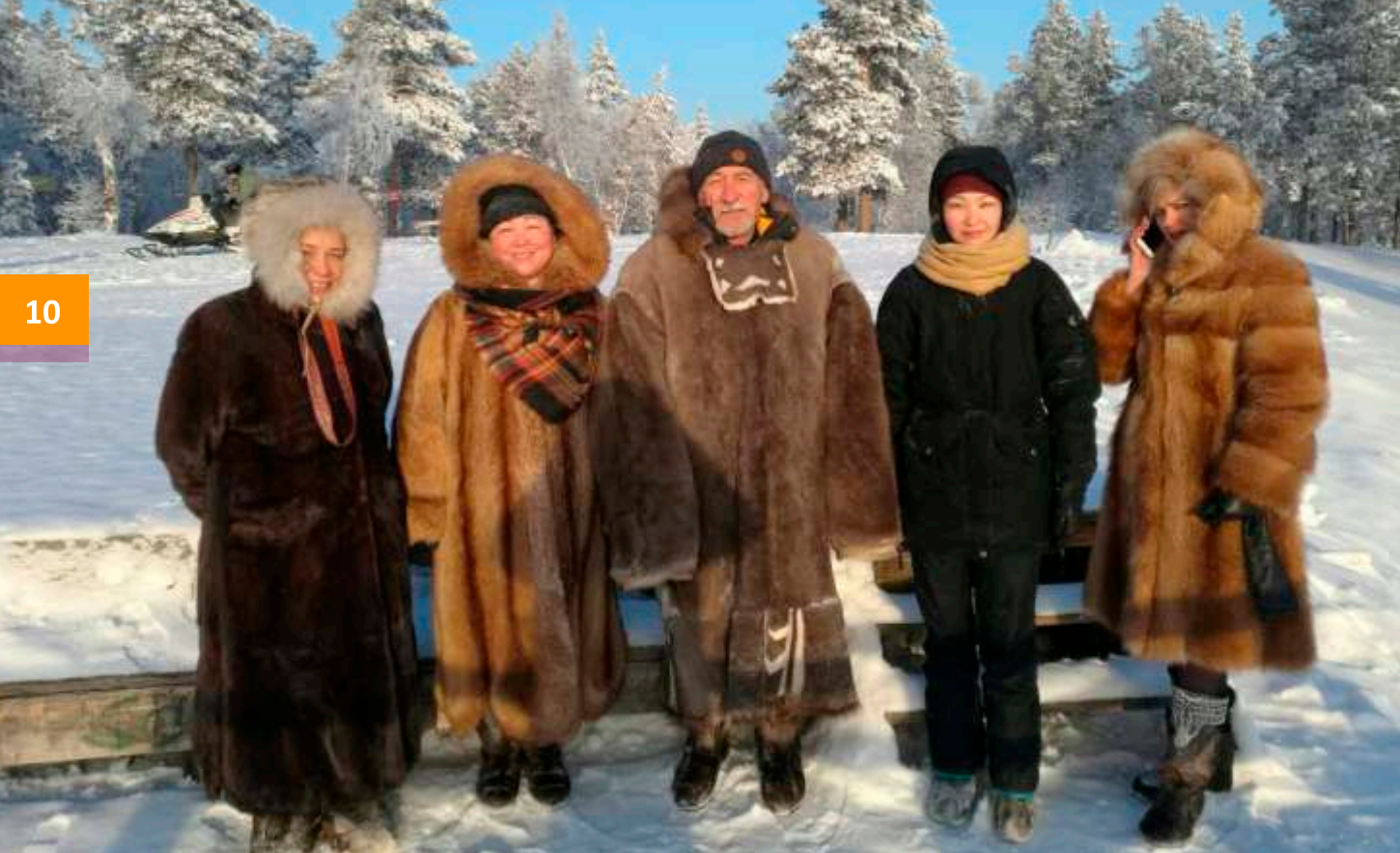
UN-Habitat delegation in Yakutsk