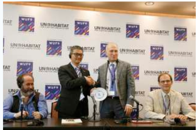
The Russian delegation at WUF9

05/2018 The UN-Habitat Moscow Office was renamed into the Project Coordination Office for Countries of the Commonwealth of Independent States (CIS).