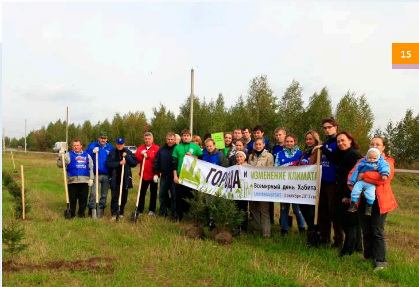
World Habitat Day celebrated in Russia and CIS