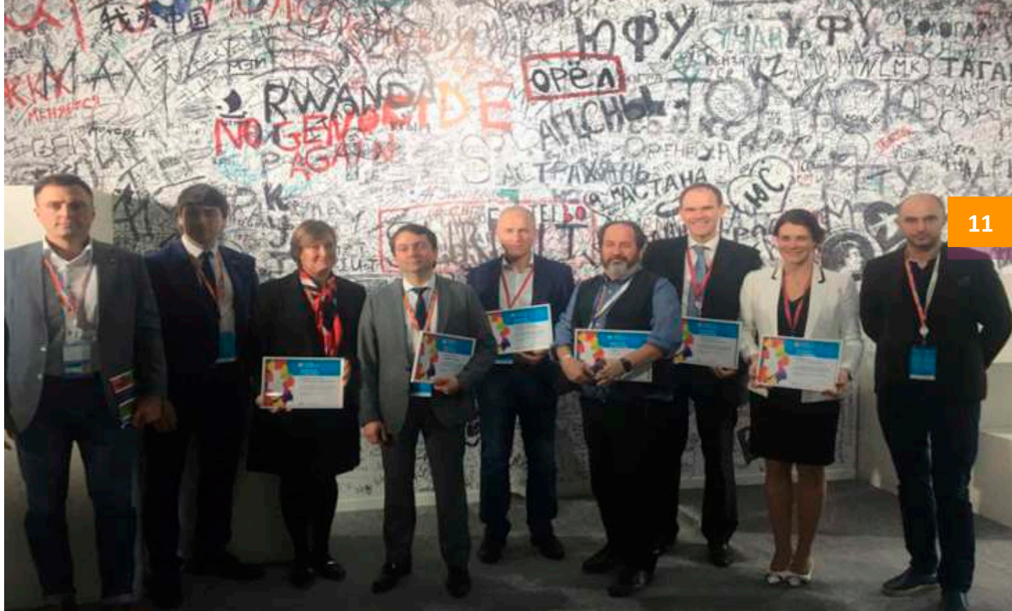
UN-Habitat delegation in Sochi

06/2017 International Conference “Public space as a place for dialogue: Promoting the implementation of the New Urban Agenda in Russia and the CIS Region” (St. Petersburg, Russia) was jointly organized by the Ministry of Construction, Housing and Utilities of the Russian Federation, UN-Habitat and the Municipal Government of St. Petersburg. UN-Habitat Executive Director Joan Clos visited Russia to attend the St. Petersburg Economic Forum