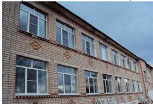
Project in the Voronezh Region

2012-13 Implementation of the project on assistance to schools in the Voronezh Region affected by severe forest fires (funded by the Royal Ministry of Foreign Affairs of Norway)