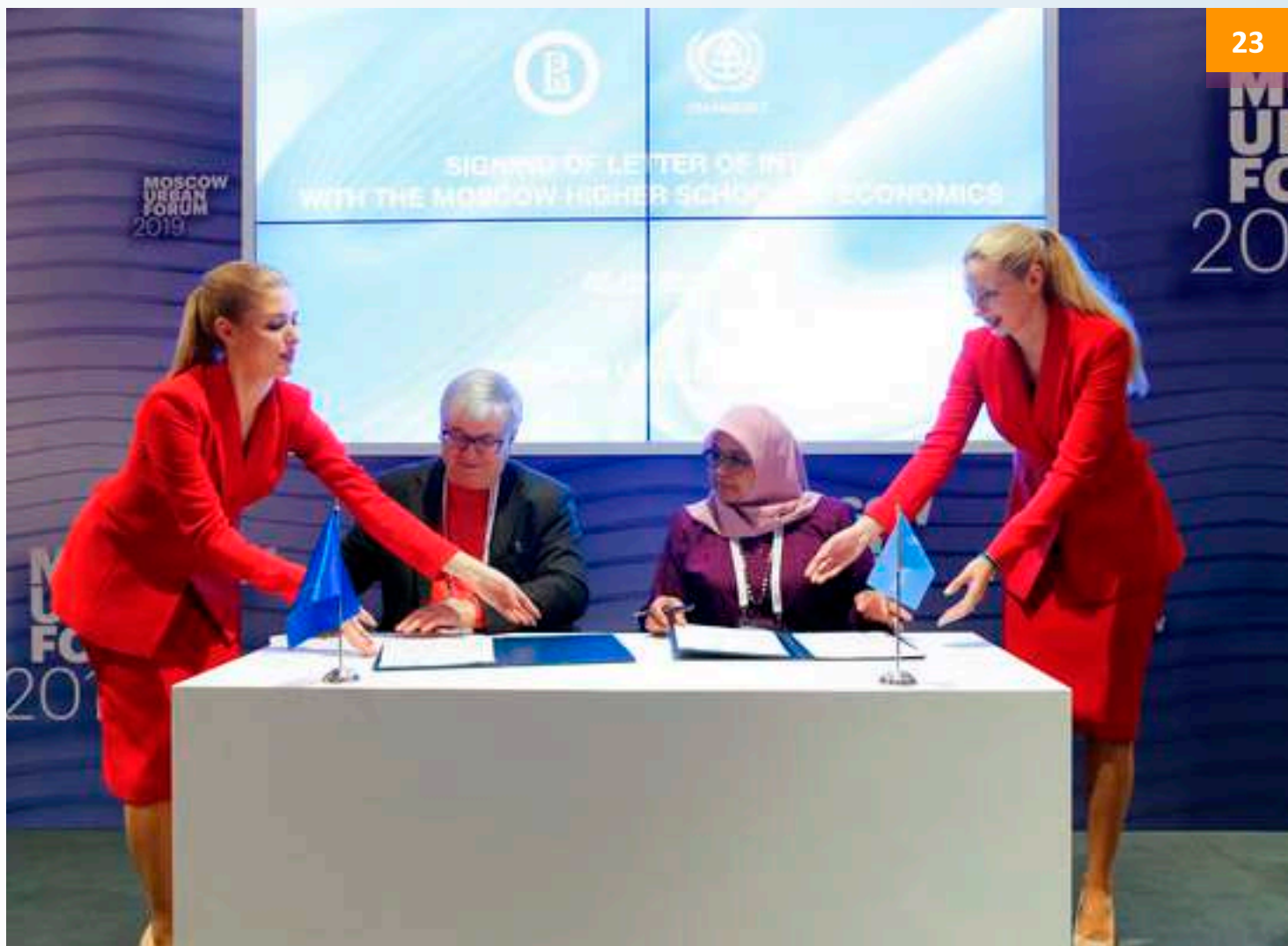
Ms. Maimunah Mohd Shrif, Executive Director of UN-Habitat pays her first visit to Russia