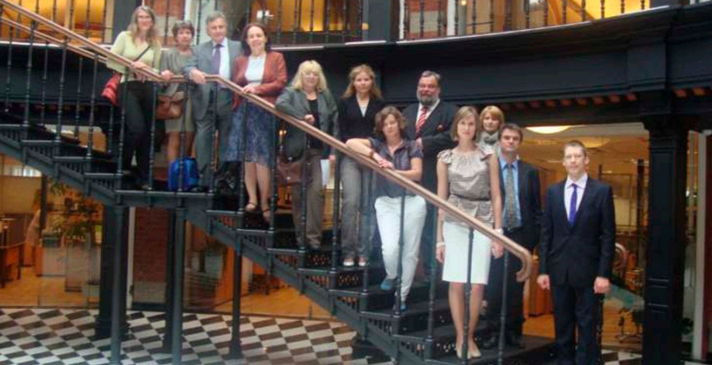
Participants in the UN-Habitat workshop on brownfields redevelopment visit sites in St.Petersburg