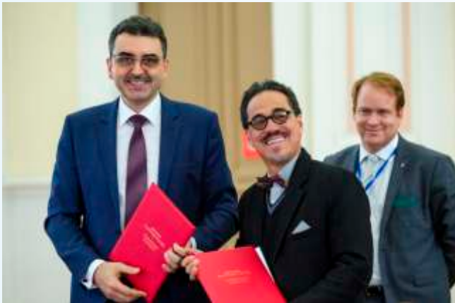
Memorandum with Tomsk State University signed

02/2018 A delegation from Russia took part in the Ninth session of the World Urban Forum (WUF 9) "Cities 2030, Cities for all: Implementing the New Urban Agenda" held in Kuala Lumpur, Malaysia. A number of networking events were held.