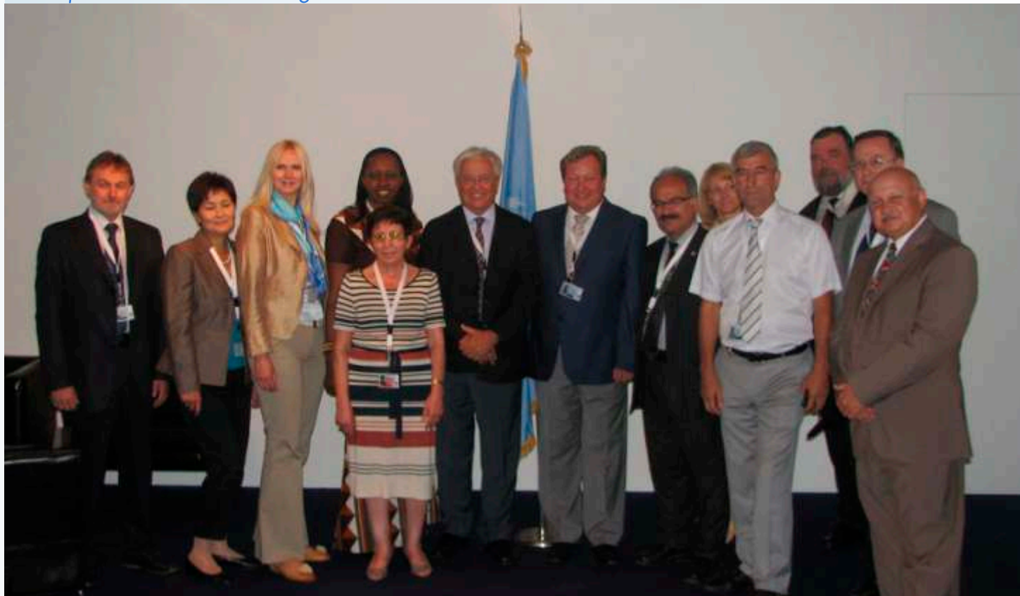
Participants in the third meeting of the Commission UN-Habitat - CIS

09/2012 The third meeting of the Commission UN-Habitat – CIS held during the Sixth session of the World Urban Forum (WUF 6) in Naples (Italy)